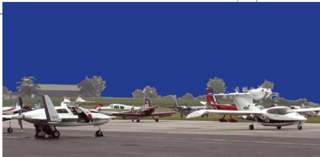
Experimental Aircraft begin the race to Oshkosh from Dayton-Wright Brothers